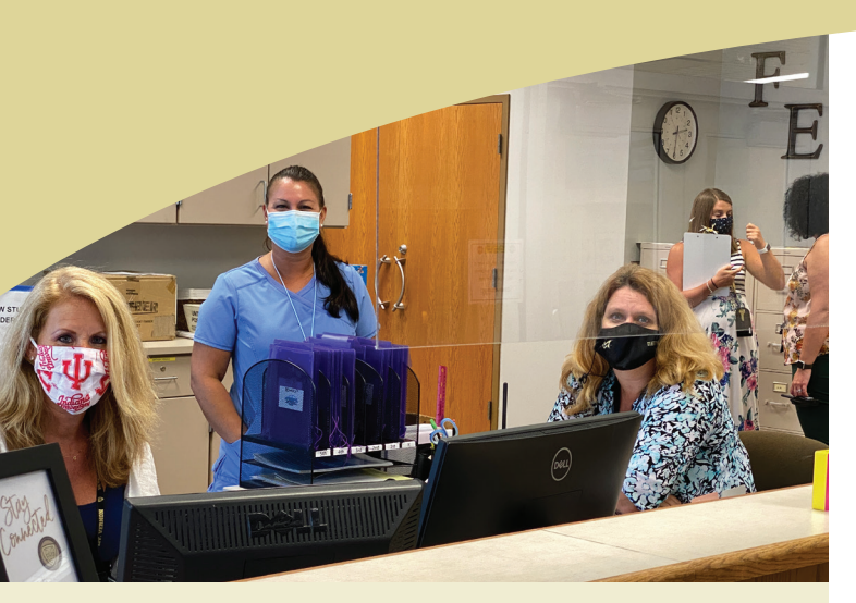
SUPERINTENDENT Continued from page 1

approach to teaching and learning. We recognize that focusing on relationships and mental health while still providing quality learning experiences is the best way to set our students up for success in the future. The loss of learning can be regained, and even accelerated, once we are through this pandemic; but getting our students back on track quickly hinges on their emotional readiness to learn.